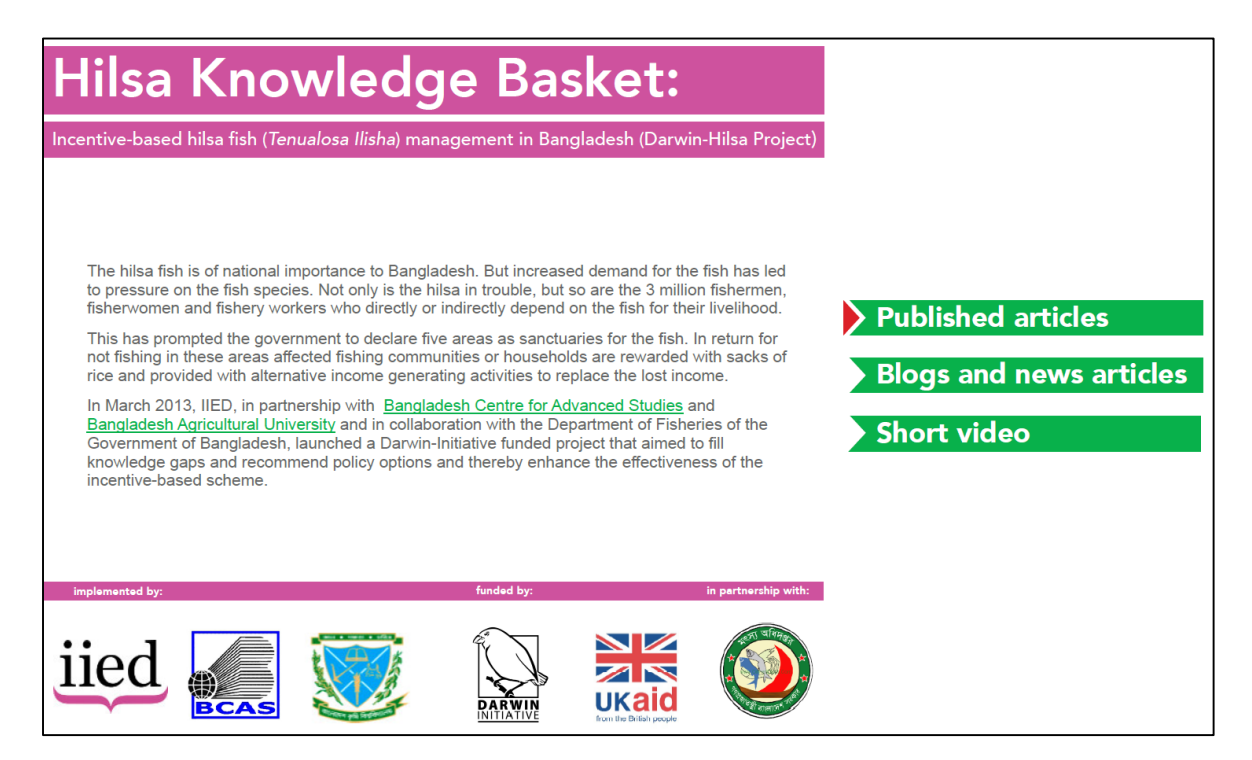
Figure 2 Hilsa Knowledge Basket user interface (sample available up on request).